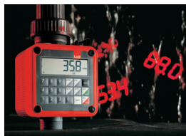
Flow Meter System