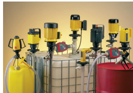
Drum and Container Pumps